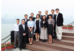
The Martin Currie Shanghai team